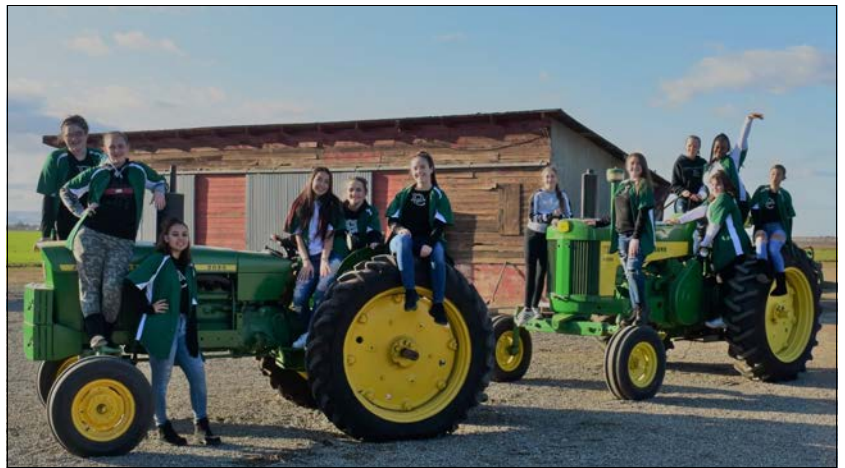
Delta Charter School visits Ag museum

Starting on Saturday, March 21, the Barnstormers will have a work day at their antique farm equipment museum on River Road. The group also will have equipment displayed at the Rising Sun School's 150th anniversary party on Saturday, April 4. They will be back at the museum on April 18.